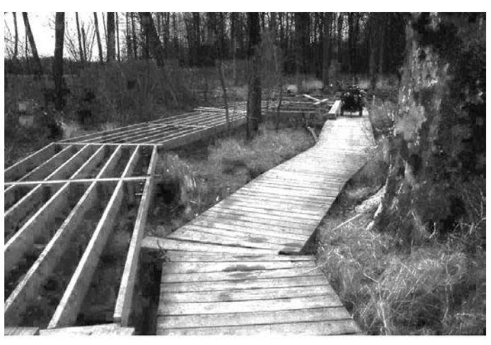
New Boardwalk Being Build Adjacent to Old

period! Fortunately, in 1990, the County was denied permission to construct the highway through the park, since it was determined by the National Park Service that adverse environmental impact to